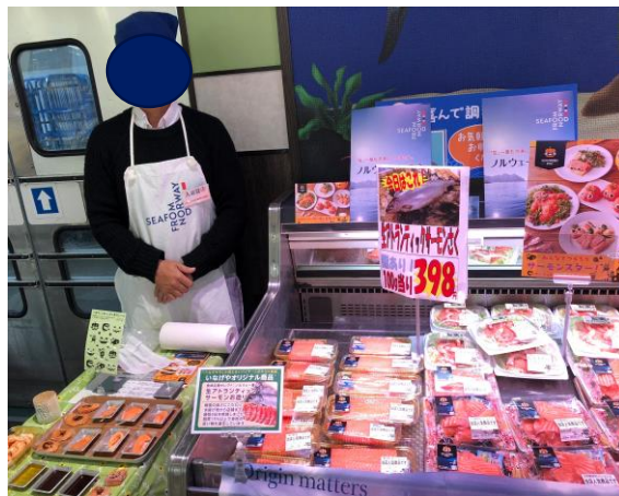
*Necessary material poorly visible