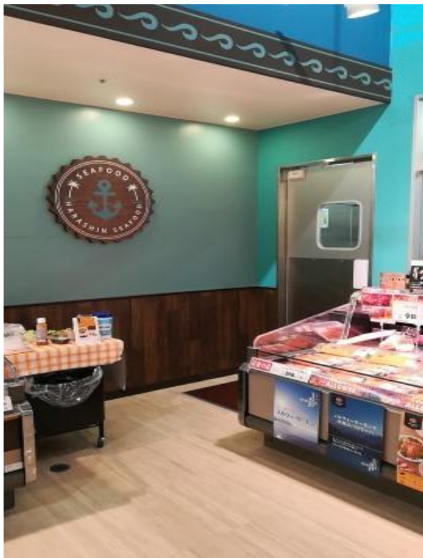
*Scope of picture poor