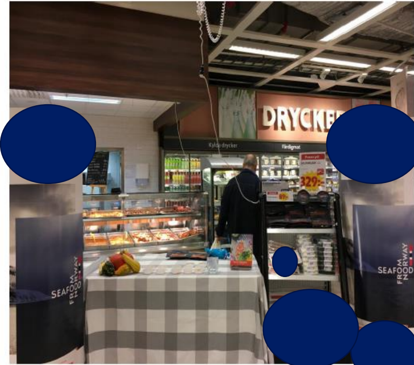
ICA Metro Täby