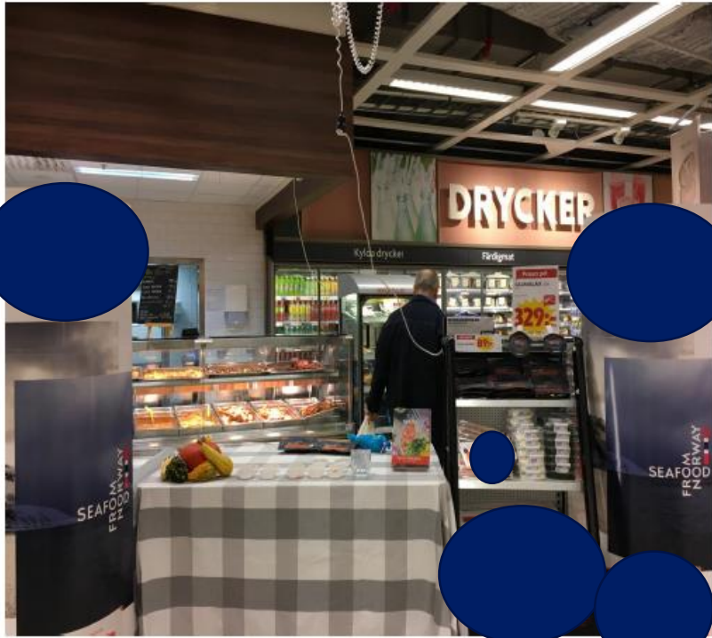
ICA Metro Täby